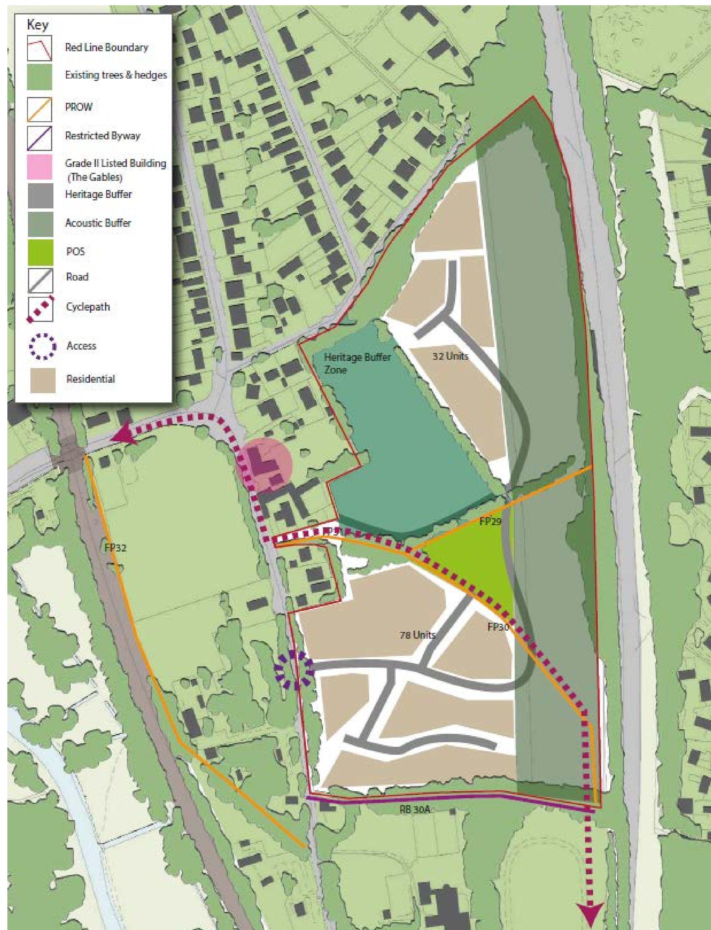
Figure 4: Proposed Land Use

The proposed land use plan in Figure 4 shows the opportunities the development can provide, including the following.